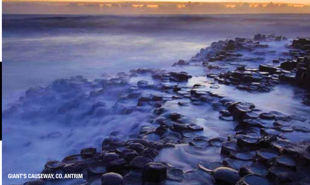
GIANT'S CAUSEWAY, CO. ANTRIM

From giants to gourmet to the beauty and wonder of nature, you never know what is in store for you in Ireland. Each trip is unique, but a vacation here is a journey of a lifetime. To get started, visit discoverireland.com for travel tips, destination videos, and great vacation offers. Go Where Ireland Takes You.