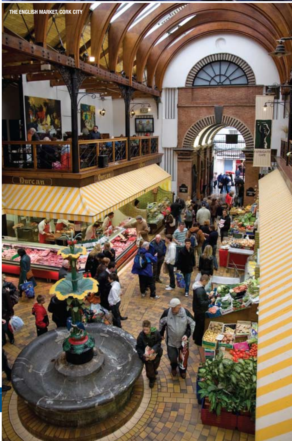
THE ENGLISH MARKET, CORK CITY